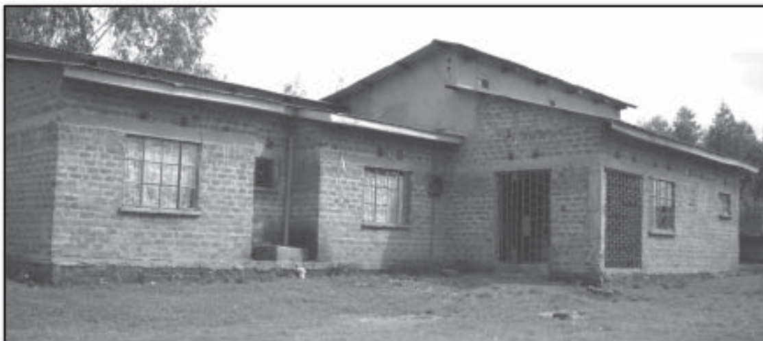
The Lubao Peace Centre

The African Great Lakes Initiative (AGLI) is a programme created by Friends Peace Teams (FPT). FPT is an organization consisting of sixteen Friends (Quaker) yearly meetings in the USA who have united to support the Friends tradition of promoting a more peaceful world. AGLI's mission is to strengthen, support and promote peace activities at the grass roots level in the Great Lakes region. AGLI responds to requests from local religious and non governmental organizations that focus on conflict management, peace building, community trauma healing and reconciliation. Since its beginning in 1998, AGLI has worked with the people of the Great Lakes Region in Africa on a wide variety of projects ranging from international work camps to the creation of the AVP program in Kenya, Rwanda, Uganda, Burundi, eastern Congo and Tanzania. They have also introduced community trauma healing workshops in Burundi, Rwanda, Uganda and now Kenya.