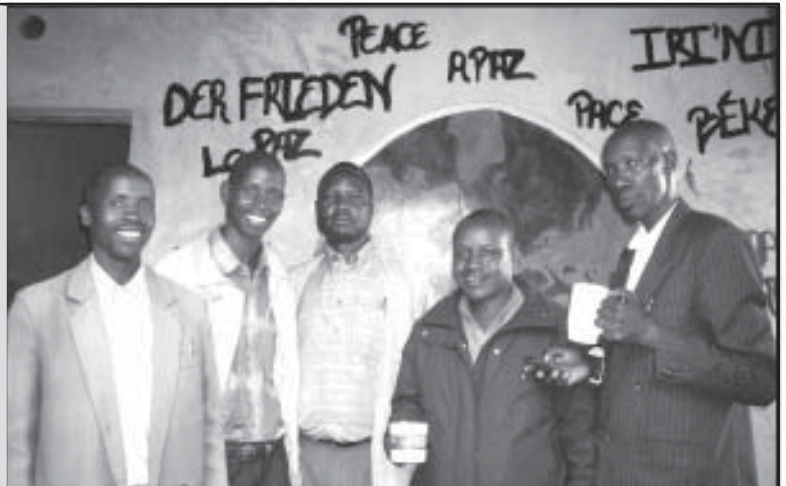
HROC Workshop participants from Mt Elgon in front of the Peace Centre's mural

This report provides a background for AVP, its implementing organizations in Kenya and the specific context in Kenya's Western, Rift, and Nyanza Provinces. We outline the method used to gather information, highlight the findings, and make recommendations for AVP's future in Kenya.