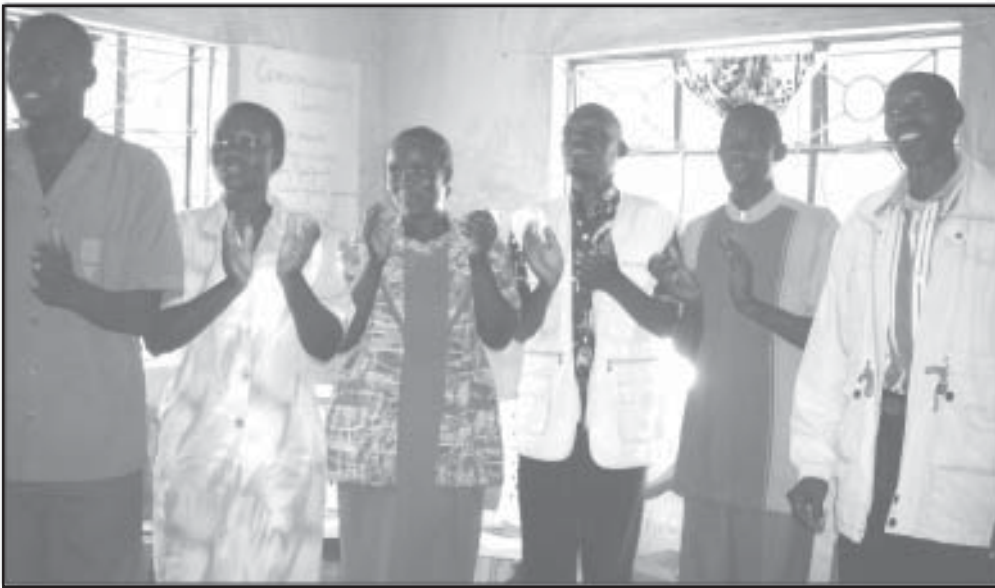
Participants begin each session with song and dance