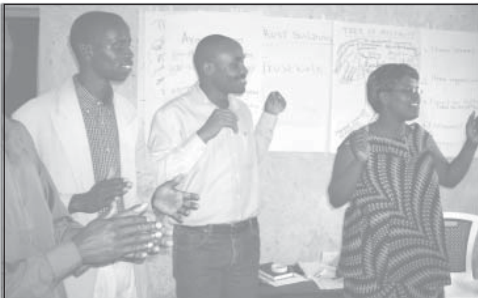
Workshop facilitators lead the group in song and dance

People working in the broad area of social work also found AVP helpful. Those counseling victims of domestic violence gained further skills useful in their work.